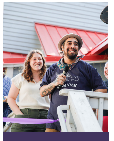
New Members - 114