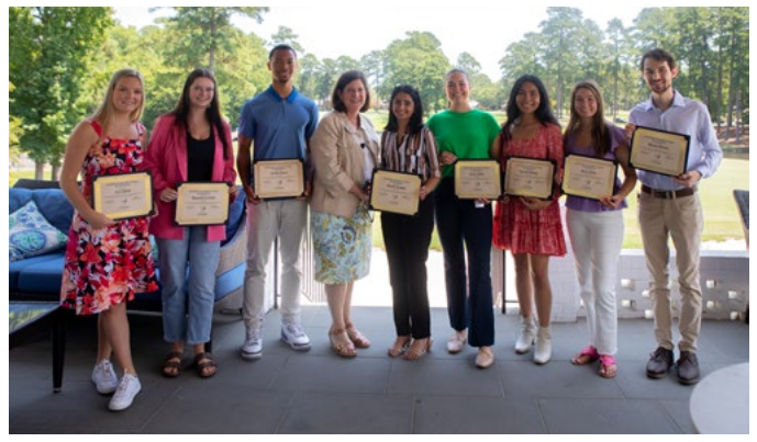
Intern Experience - Wrap Up Celebration

The chamber's Intern Experience , presented by the City of Greenville , was an initiative designed to engage college interns with different facets of the community, in the effort to recruit and retain talent for future success. Over a six-week period, the program equipped participants with valuable skills to take with them as they enter the workforce and entice them to fall in love with Greenville-Pitt County and the companies with which they are interning. Fourteen (14) participants successfully completed the program and were awarded certificates during a wrap-up celebration at Brook Valley Country Club.