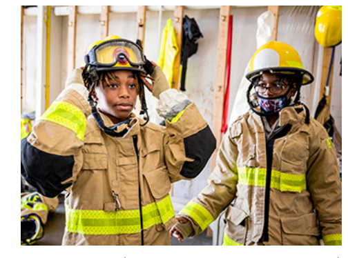
Grow Local Week