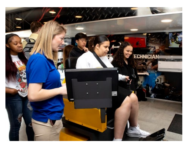
Grow Local Week - March 27-31, 2023

Over 2,930 students participated in the chamber's Grow Local Week , held March 27-31, 2023. Grow Local is a workforce development initiative designed to create and unveil career interests, grow the talent pipeline, and connect local businesses to future employees. Eighty-six (86) Pitt County businesses opened their doors to host middle and high school students during the week-long program. The Be Pro Be Proud Mobile Workshop experience, on the campus of Pitt Community College, was a new inclusion to Grow Local in 2023. Be Pro Be Proud delivers a ground-breaking set of tools and resources designed to help students explore, plan, and launch careers in today's technical roles. Grow Local program partners in 2023 included Catalent , the Greenville-ENC Alliance , Pitt County Economic Development , and Pitt County Schools .