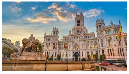
Chamber Trips - Spain

The chamber organized affordable international and national trips for both its members and the public, offering travelers an opportunity to explore the global economy and experience what other parts of the world have to offer. These distinctive trips offered participants an enriching cultural and educational experience, while also promoting connections among local business professionals and retirees. In March, the chamber arranged a trip to Spain/Portugal, followed by a journey to Yellowstone in July.