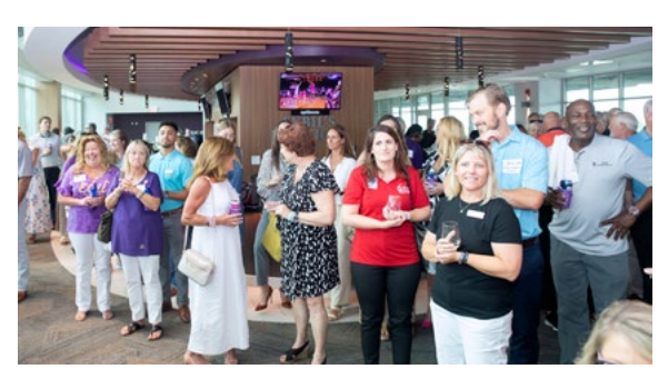
Business After Hours (Monthly)