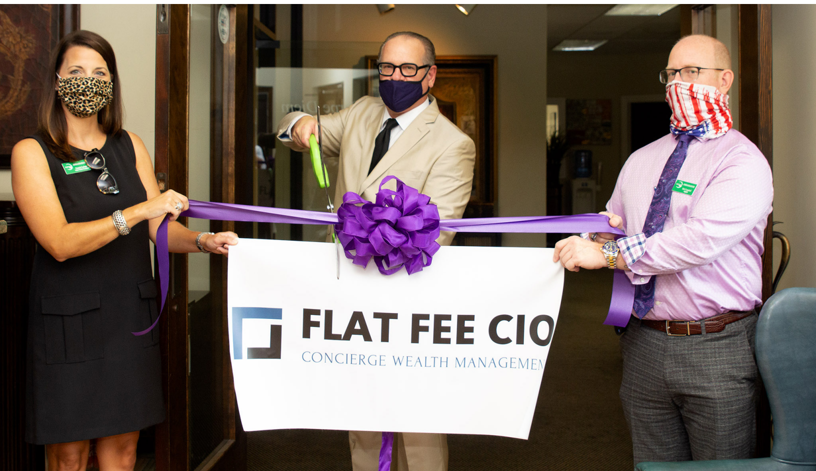
Flat Fee CIO Ribbon Cutting