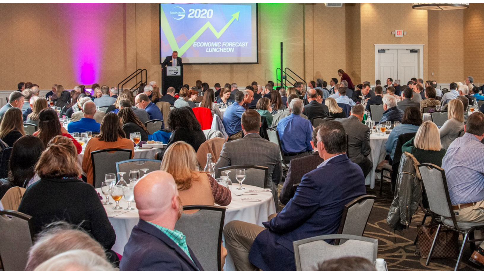
Economic Forecast Luncheon

Office space is designed to encourage collaboration and networking. The SEED Collaboration Space programs encourage and support creativity, successful business startup and rapid growth.