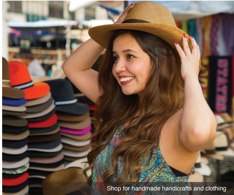
Shop for handmade handicrafts and clothing

DAY 1 USA / Panama City, Panama: Depart the USA on your flight to Panama City. Upon arrival, you'll be met by a Mayflower Cruises & Tours representative and transferred to your hotel. The afternoon is at leisure to become acquainted with your new surroundings. This evening, join your Tour Manager for an orientation meeting at the hotel.