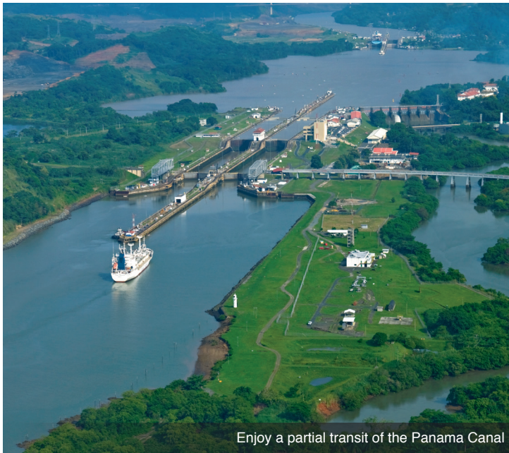
Enjoy a partial transit of the Panama Canal