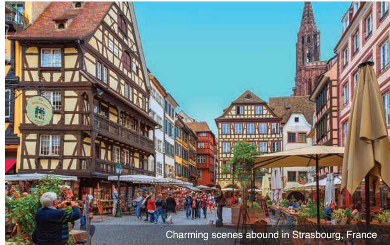
Charming scenes abound in Strasbourg, France

DAY 1 Depart the USA: Today you'll depart the USA on your overnight flight to Zurich, Switzerland.