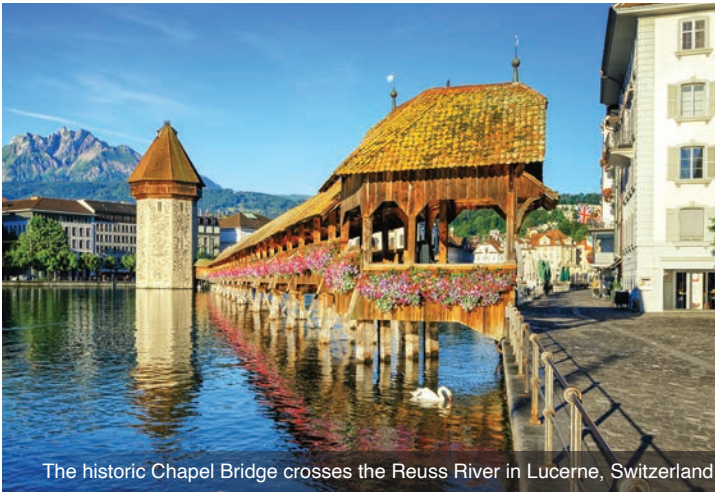
The historic Chapel Bridge crosses the Reuss River in Lucerne, Switzerland