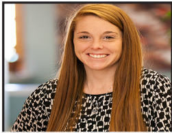
Amber Idol MHAworks