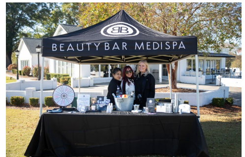
Open Fore Business Expo and Golf Tournament

Organize and implement the Ambassador Program . Identify additional ways in which the Ambassadors can effectively help the chamber achieve its mission.