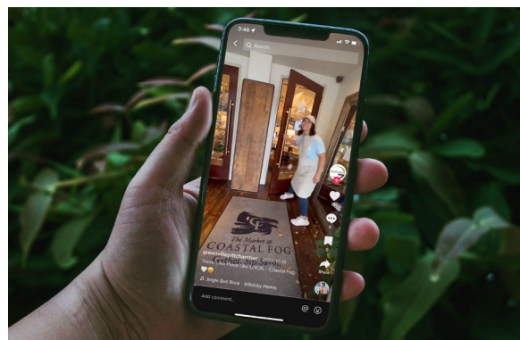
Greenville-Pitt County Chamber of Commerce, There's No Place Like Local Social Media Campaign

The chamber's biweekly E-Newsletter was created and distributed to the membership 25 times in 2022. Each newsletter featured a members news section and information on upcoming chamber events and programs. Each newsletter featured the chamber's newest members with a link to that respective member's business directory listing on the chamber's website.