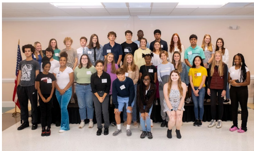
Teen Leadership Institute

Economic Forecast Luncheon - Inform members of trends affecting business climate and the economy.