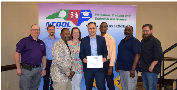
Safety Awards Banquet

The chamber, in partnership with the North Carolina Department of Labor (NCDOL), hosted the Safety Awards Banquet , presented by Nutrien, on April 28, 2022, at the Holiday Inn. The NCDOL's Safety Awards Program is administered through its Education, Training and Technical Assistance Bureau of the Occupational Safety and Health Division. The annual event recognizes private and public firms that achieve and maintain good safety records. Seven chamber member businesses were recognized as industry leaders in safety.