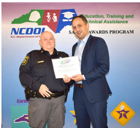
Safety Awards Banquet

Provide regional leadership through participation and collaboration with the Chambers of Commerce of the eastern region (OCTAD) .