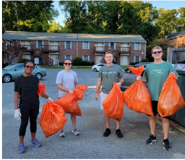
Young Professionals of Pitt County

The Young Professionals of Pitt County , presented by State Farm Insurance - Polly D. Piland Agency, closed the 2022 year with 85 members. The organization continued to promote and host a series of events that focused on professional development, community outreach, and business networking. The Young Professionals (YPs) continued to host 3rd Thursday networking events and Rise & SYP sessions as part of its focus areas for the year. The YPs also volunteered cleaning their adopted street and hosted the Great Duck Race to benefit ECU Health Cancer – raising over $7,700. Over the past seven years, the organization has raised over $69,000 in donations to benefit ECU Health Cancer Care programs and services.