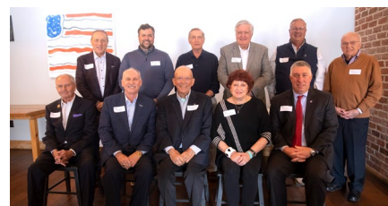
Past Chairs Luncheon

The chamber hosted a Past Chairs Luncheon , presented by Taft Family Ventures, on November 16, 2022, at 5th Street Hardware Restaurant & Taproom, that brought together former chairpersons of the chamber's board of directors. The luncheon provided an opportunity for past chairs to reconnect and inform them of the work the chamber continues to do in the community, while also celebrating the work they accomplished to grow a greater Greenville-Pitt County.