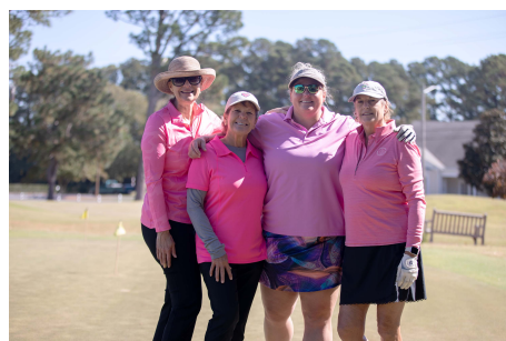
Team Carolina Hospitality Associates Open Fore Business Expo and Golf Tournament