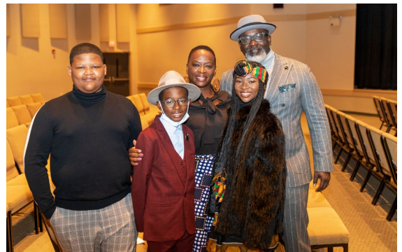
Community Unity Breakfast