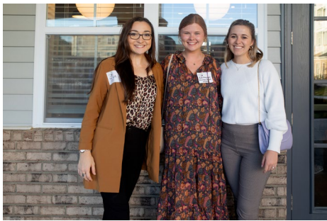
Business After Hours, 904 West

Business After Hours , sponsored by Advantage Therapy Solutions (six months), was the chamber's premier networking event in 2022, with an average attendance of 78 people per event. Eleven Business After Hours events were held to showcase member businesses and encourage networking among chamber members. Business After Hours host sites in 2022 included: Kinetic Physical Therapy and Wellness, Holiday Inn, Eastern Radiologists, The Heritage at Arlington Apartment Homes, Garris Evans Lumber Company, Advantage Therapy Solutions, Ron Ayers Motorsports, Beauty Bar Medispa, 904 West Apartments, Ronald McDonald House of Eastern North Carolina/Telco Credit Union, and Pitt County Council on Aging.