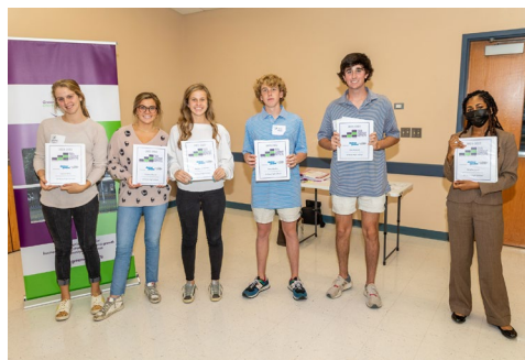
Teen Leadership Institute

The chamber's Teen Leadership Institute , presented by Barbour-Hendrick Honda, provided Pitt County high school students (sophomores and juniors) with opportunities for growth in leadership and community awareness. Thirty-two (32) participants took part in five program sessions (one session per month), from November - April, with each session focusing on a specific area of leadership growth and community awareness. Volunteers from East Carolina University, Pitt Community College, ECU Health Medical Center, the City of Greenville, and other local government agencies assisted with the operation and implementation of each session. The program culminated with a graduation ceremony in May with all 32 students receiving a certificate and cord to signify their successful completion of the program.