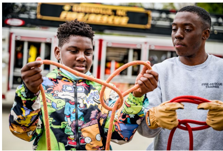
Grow Local, Fire Department

The chamber's Grow Local week was held March 28 - April 1, 2022. Grow Local is a workforce development initiative where Pitt County businesses open their doors to host local middle and high school students, exposing participants to a specific career, company, or industry. The program, in partnership with Pitt County Schools, is meant to introduce, involve, inspire, and invest in the lives of our future workforce. Over 2,900 students and 99 businesses participated in the week-long program. Program partners included Pitt County Economic Development, Mayne Pharma, and the Greenville-ENC Alliance.