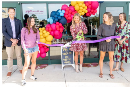
Ribbon Cutting, Wildflower Florist