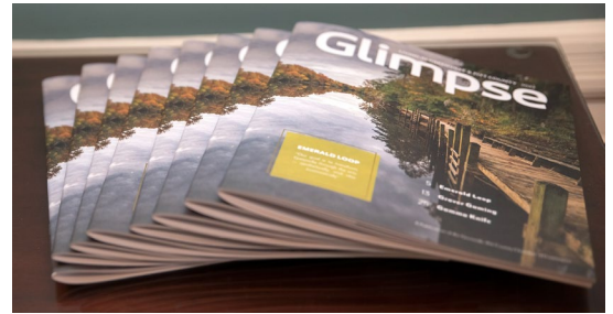
Glimpse Magazine 2022