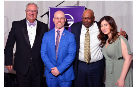
Annual Membership Celebration 2022