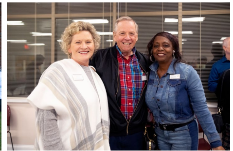
Business After Hours, Pitt County Council on Aging-Greenville Senior Center

The chamber coordinated affordable International Trips for chamber members and the public to give community members a look at the global economy and experience wonders of the world. These unique excursions provide travelers with an educational and cultural experience, while fostering connections between local businesspeople and retirees. The chamber sent travelers to London/Paris and Poland in 2022.