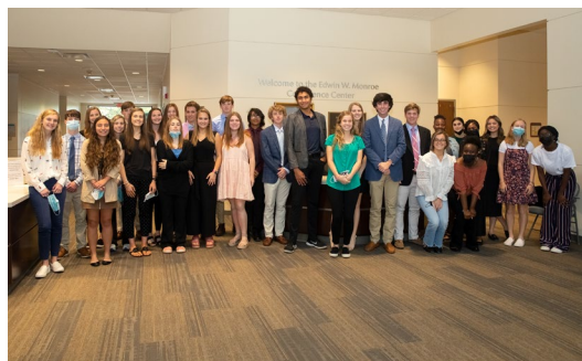
Teen Leadership Institute