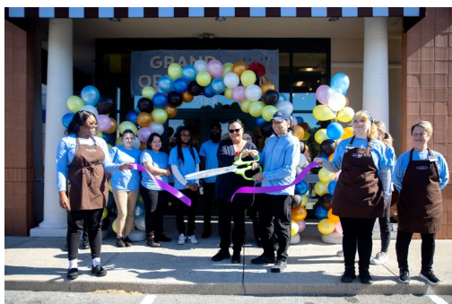
Ribbon Cutting, Nothing Bundt Cakes

Organize and implement the Ambassador Program . Identify additional ways in which the Ambassadors can effectively help the chamber achieve its mission.