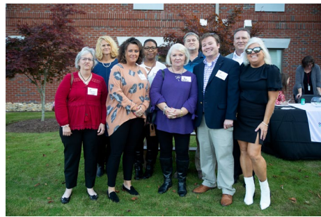
Business After Hours, RMH & Telco