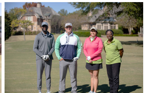
Team Koinonia Community Solutions Open Fore Business Expo and Golf Tournament