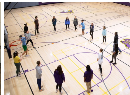
Teen Leadership Institute