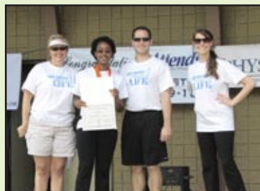
Chamber staff stand with a representative of Team People Committed More to Health

Friday marked the finish of the 2011 Live Healthy Greenville-Pitt 100-Day Challenge presented by the Chamber, Live Healthy America, Physicians East, BlueCross and Blue Shield of NC and University Health Systems of Eastern Carolina. More than 1,200 participants lost 5,748 pounds, and logged about 70,517 hours of activity from January 21 to April 29.